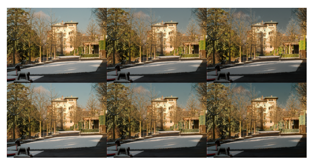
Figure 10. Top row: HSV-based rendering by blending the channels. From left to right, images where the V channel is composed of 25%, 50%, and 75% of the near-IR channel. The rest being provided by the original V channel. Bottom row: the same percentages applied to the Y channel of the YCbCr image.

Current digital cameras are intrinsically able to capture near-infrared images. In this paper, we have investigated physical phenomena that are of particular interest to digital photography and that can be enhanced by the use of near-IR images. Since most of these phenomena deal with contrast, brightness,