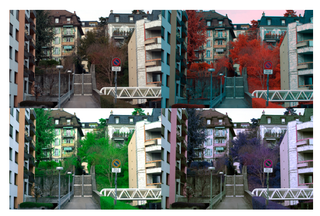
Figure 6. Top left: Original RGB image. Top right: NIR-G-B image (swapping NIR for R). Bottom left: R-NIR-B image. Bottom right: R-G-NIR image. Note that simply considering the NIR channel as a colour is not sufficient for a meaningful representation.

Perhaps the simplest method to display visual and near-IR information at the same time is to simply consider near-IR as an extra channel. One can therefore swap this fourth channel for one of the original ones, creating an illusion of a regular image. Unfortunately, this method is too simple to provide meaningful results given that near-IR is not really correlated with a single colour channel; the resulting images can therefore be awkward, as shown in Fig. 6, which indicates that one should indeed consider near-IR data as spatial information or lightness rather than colour.