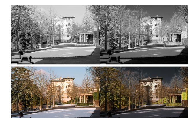
Figure 7. Top row: the V channel of the visible image (left) and the near-IR image (right). Bottom row: the original visible image (left) and the coloured NIR image (right). Note that while bright regions are generally well rendered, dark regions such as sky appear almost achromatic.

The question of which information channel is best suited to include near-IR info remains. The lightness channel V in HSV appears a suitable candidate for two reasons: V is de-coupled from colour information H and S, and the way colour is encoded is suitable for preserving the appearance of surfaces when the lightness information is changed. In this experiment, we basically swap the near-IR channel for the V channel of the visible image. We expect that by preserving the hue and saturation values of the original image, the colours will appear realistic and the image will be a combination of visible colours and near-IR intensity and spatial information. Figure 7 shows that while it is the case for most of the image, image regions that are significantly darker in the near-IR appear almost colourless in the combined image, a normal behaviour considering the inverted cone structure of HSV will push the dark values towards achromatism.