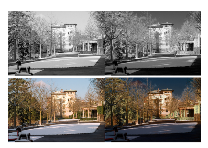
Figure 8. Top row: the Y channel of the visible image (left) and the near-IR image (right). Bottom row: the original visible image (left) and the coloured NIR image (right). Note that while dark regions are generally better rendered than with HSV, bright regions such as grass appear very desaturated.

we investigate the PCA approach to see if it provides an overall better representation than either YCbCr or HSV. To that effect, we first PCA the RGB image and normalise the near-IR image so that its range is comparable to the first principal component. In a second step, we replace the original principal component by the normalised NIR image and reconstruct an RGB image using the same transformation matrix. The results indicate two trends: on most images, the outcome of PCA is similar to the one of YCbCr (although with sometimes too saturated colours), and the results are greatly image-dependent. In fact, this method is unpractical since there are images for which the first principal component is not just in the direction of lightness variance but is also tainted with chromatic information.