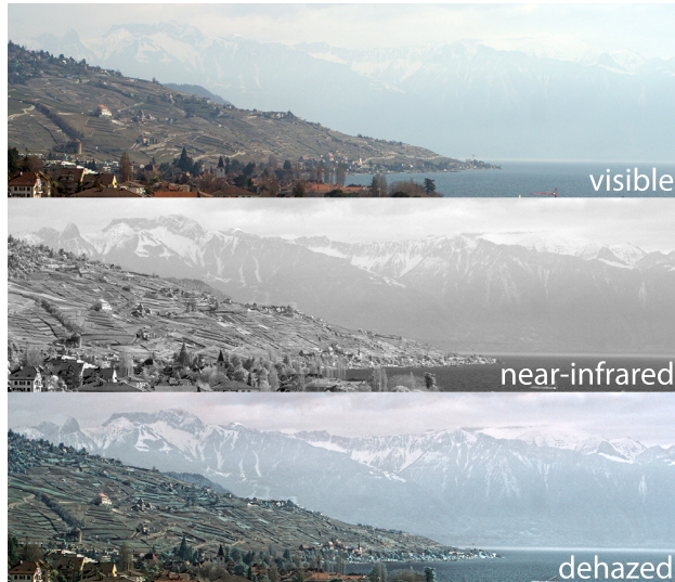
Fig. 1. Example of a scene containing haze. Note the higher contrast and sharpness in the near-infrared image and the dehazed image using our method compared to the visible image.

Due to Rayleigh’s law (Eq. 1), scattering is significantly smaller in near-infrared (NIR) than in visible images because NIR wavelengths are longer. Haze is much less present, also illustrated in Fig. 1.