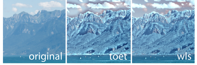
Fig. 3. Comparison of the original image, Toet's original approach and our improved approach using WLS filters. Note the halo artifacts that disappear by using edge-preserving filters.

human observer, the NIR approximation N_n^a is thus discarded. The fused image is obtained by the synthesis transform: