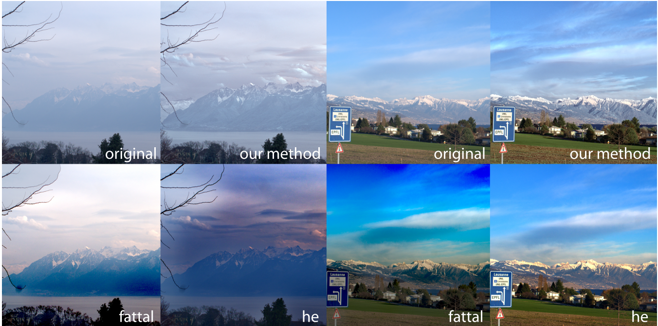
Fig. 4. Comparison of the original image, He et al.'s dehazing approach, Fattal's dehazing approach and our multiresolution fusion using WLS filters.

As we are only working with the luminance channel, colors might appear unrealistic in cases of extreme luminance changes (Fig. 3). We want to investigate in the future how our images can be improved by additional color processing.